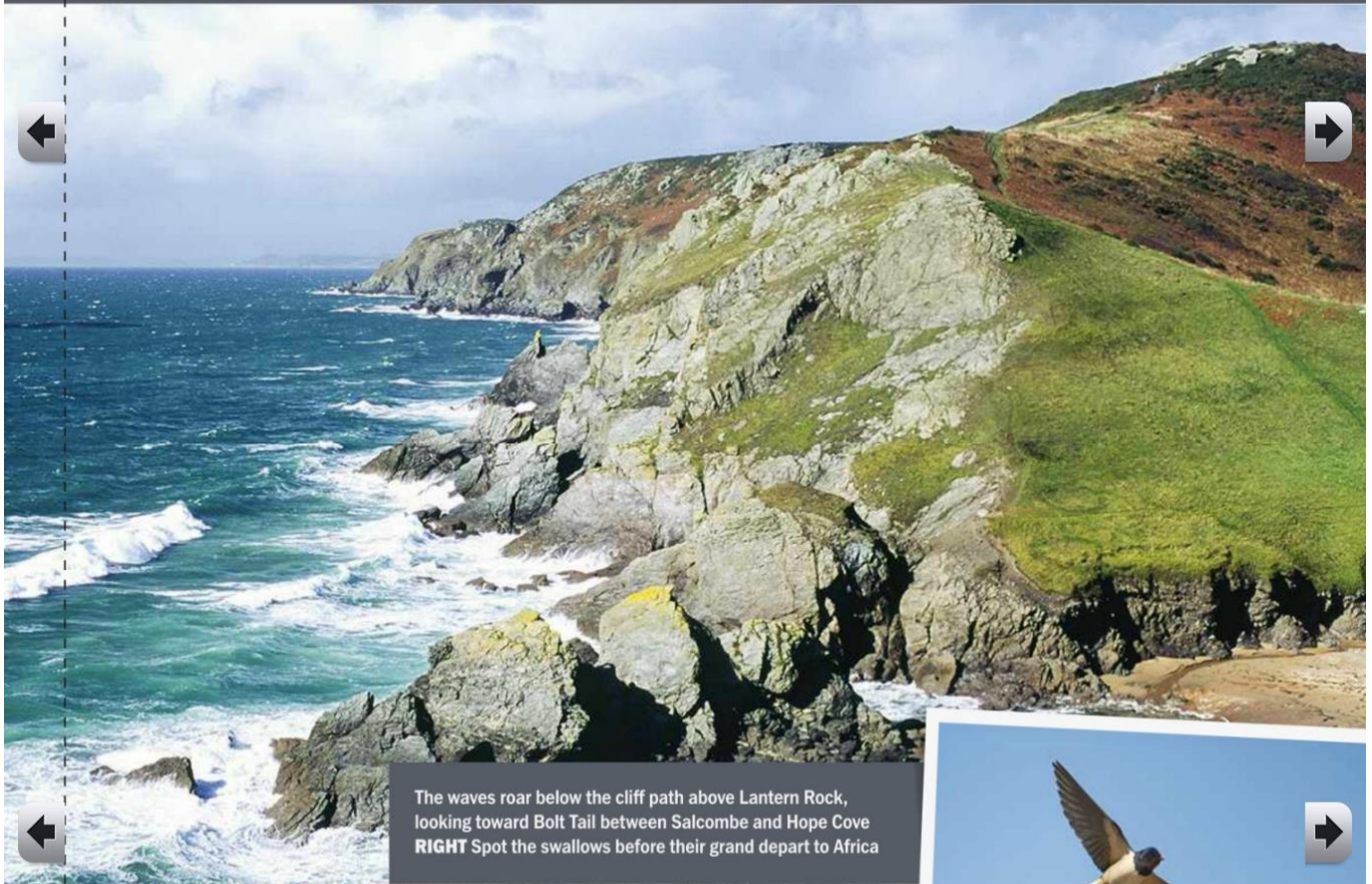
The waves roar below the cliff path above Lantern Rock, looking toward Bolt Tail between Salcombe and Hope Cove RIGHT Spot the swallows before their grand depart to Africa

Follow the swallows along a spectacular stretch of the south coast of Devon By Mark Rowe