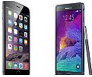
Samsung pulls out of European laptop market while share prices drop