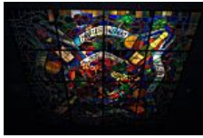
Why Did the Frenchman Cross the Ocean? (East Coast Wine and Travel)