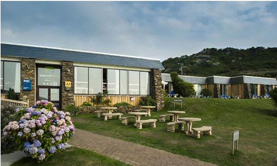
Soar Mill Cove Soar Mill Cove hotel, Devon

According to a recent survey by Inspired Luxury Escapes, retro holiday destinations are back in vogue . Generation Z are the latest marketable group flocking to trendy destinations of yore, filling up Instagram feeds not with Phillippe Starck lamps and rooftop pools, but with motel signage, Adidas slides and 99s. Forget New York Time's 52 up-and-coming places to visit this year – it's time to look back at photo albums from the Golden Age of summer holidaying. It was in this spirit that I decided to do a road trip down to Devon.