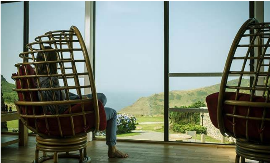
Soar Mill Cove