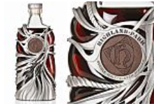
Orkney's Ancient Island Spirit (Robb Report)