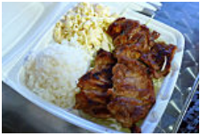
Local Flavors around Honolulu (AFAR)