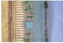
A certain level of wrongness (WeeklyGrape)