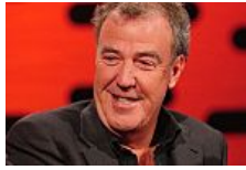
Clarkson rubbishes Top Gear axe